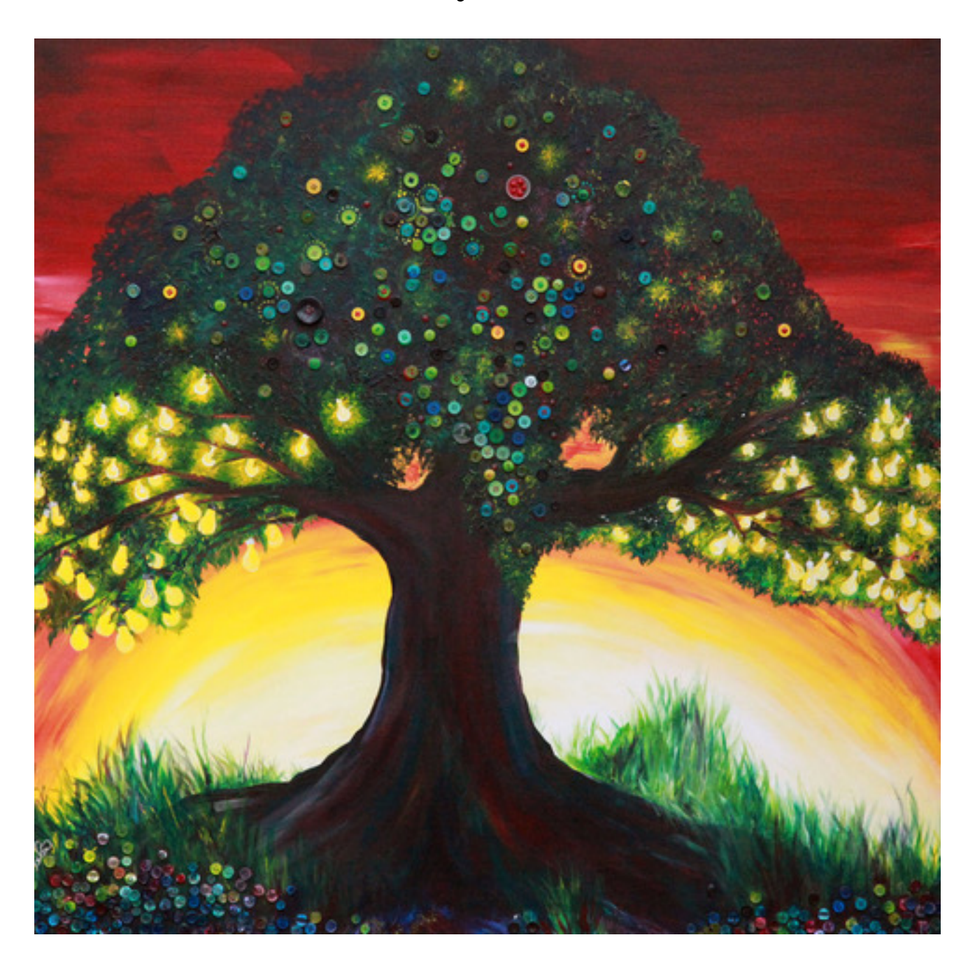
Trinity Presbyterian Church

420 Melrose Avenue, Santa Cruz, California 95062 www.trinitypressc.org ♦ trinitysc@sbcglobal.net (831) 423-8995